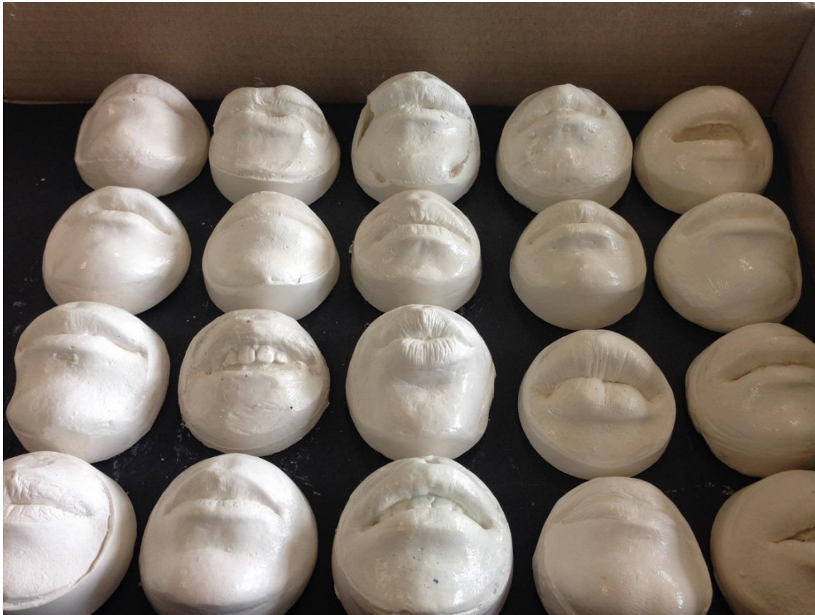
Speak, Halifax West